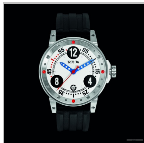
V6-44 Stand 21 Watch by B.R.M. Chronographes